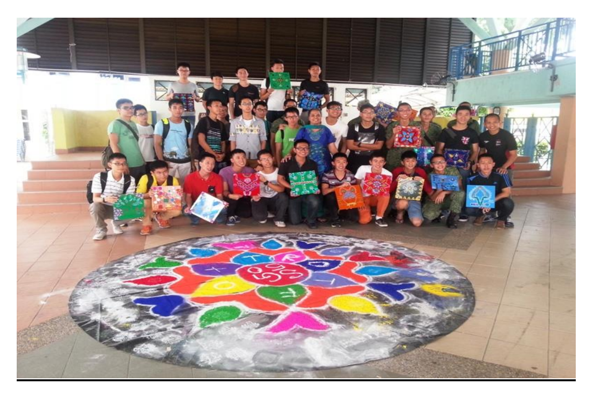
Rangoli workshop for SMU Students-2014/2015/2016 /2017/2018